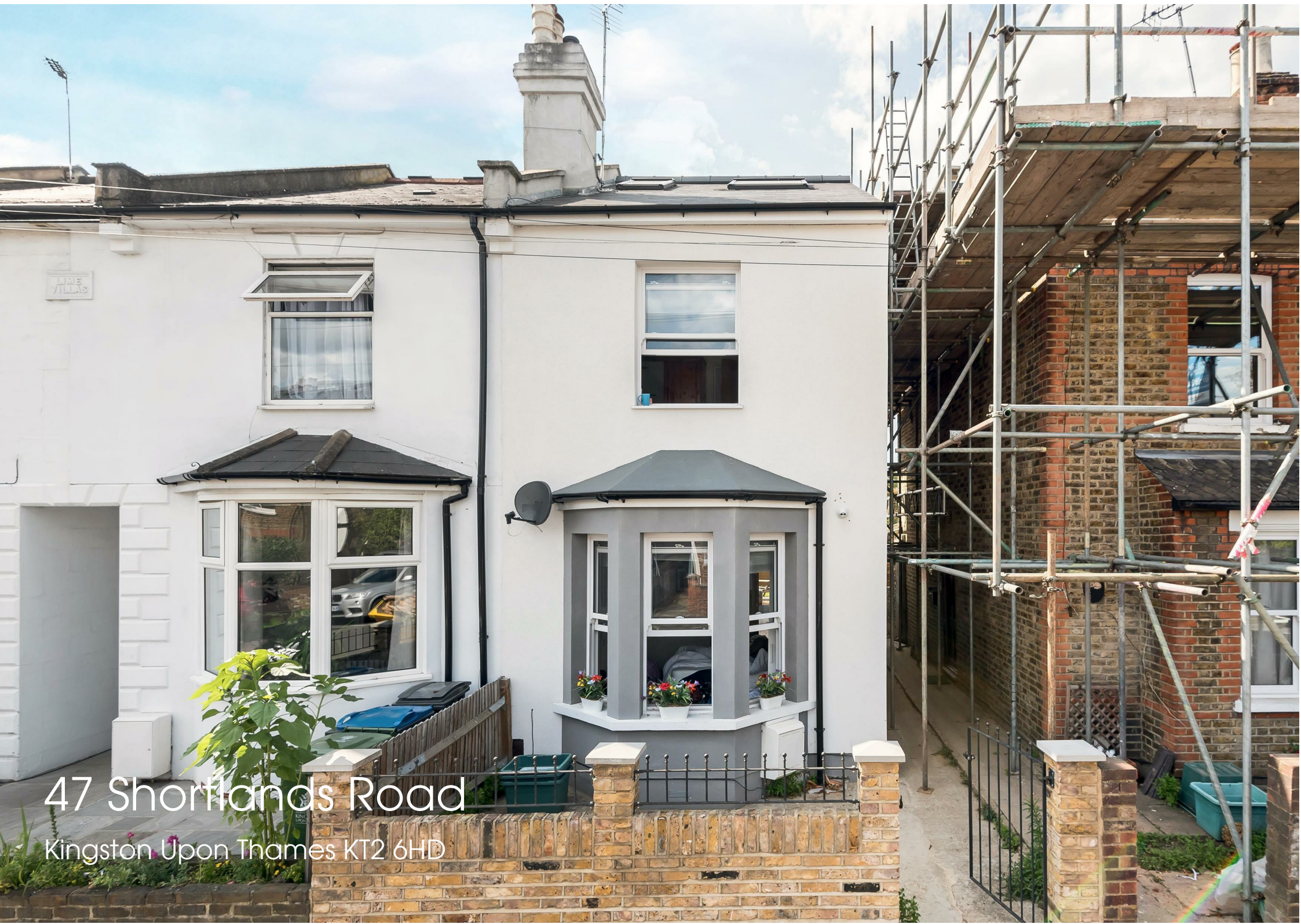
47 Shortlands Road Kingston Upon Thames KT2 6HD

34 Richmond Road Kingston upon Thames Surrey KT2 5ED www.gibsonlane.co.uk Tel: 020 8546 5444